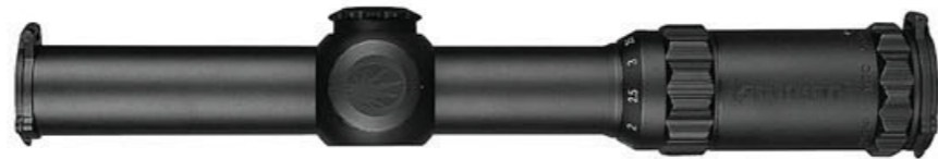
Mamba 1-4x24 SIR