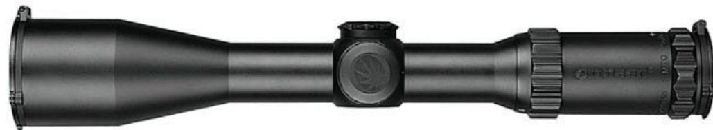
Mamba 1.5-6x42 SIR