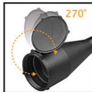
270° Metal Flip-up Lens Cover