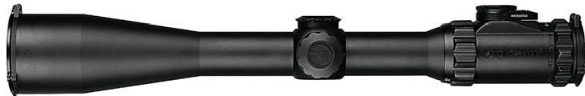
Mamba 3-12x44 SFRIR