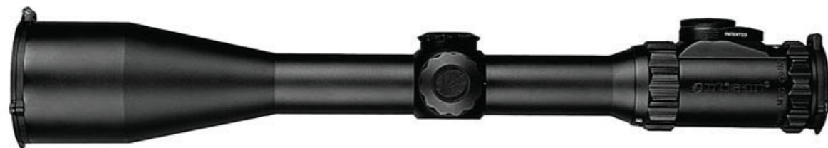
Mamba 4-16x50 SFRIR